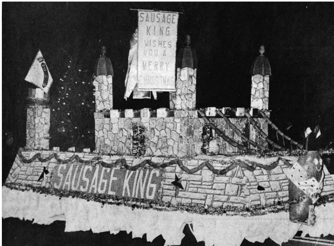
Sausage King float was popular one in the parade, but the Knights of Columbus entry was selected the winner. ( The Star-News, Dec. 4, 1975 ).