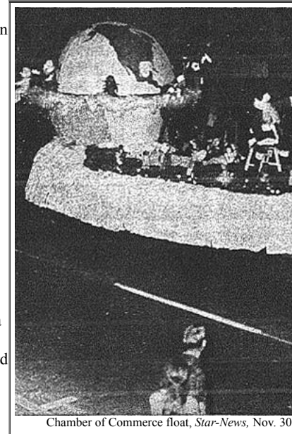
Chamber of Commerce float, Star-News , Nov. 30