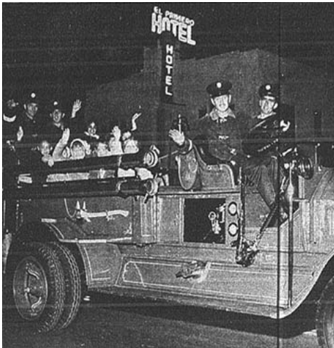
Fire truck "Old Goose" in Star-News , Dec. 4, 1969)

1969/12/04 - Parade Opens Christmas Season Here. Thousands of person from all over the county turned out Monday night to watch the Christmas season ushered in with Chula Vista's 5th annual Starlight parade. Drums, band music, sparkling Christmas lights and a record turnout provided a festive air for the hour-long parade started at H St. and moved down 3rd Avenue to end at E Street. ( The Star-News , Dec. 4, 1969)