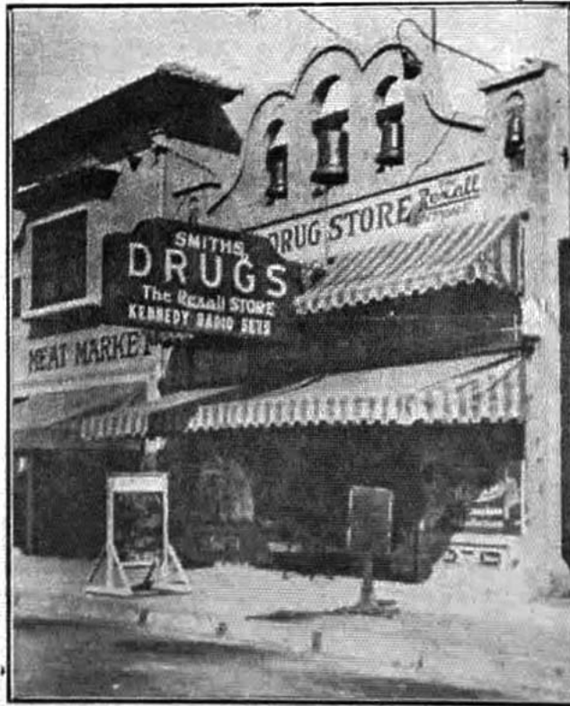
picture of Smith's new Rexall drug store ( Chula Vista Star, Dec. 18, 1925 ).

1920/09/03 - Mr. Smith of Smith's Drug Store says that Rexall stores are taking a straw vote for president, 4 yrs ago 9 million votes in 9 days predicted Wils election. The ballot box is in Smith's store. ( Chula Vista Star, Sept. 8, 1933. )