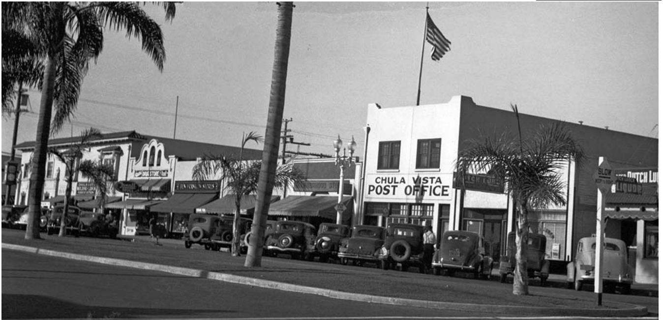
View of Third Avenue Businesses and Palm Plaza in 1937. Melville building is in the left side of the photo along with other shops and the post office. Rexall Drug Store, Dutch Lunch Liquor

1938/05/20 - Zurcher has remodeled drugstore. ( Chula Vista Star, May 20, 1938. )