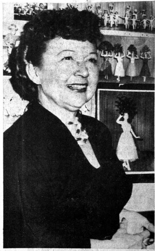
TODAY SHE STILL DANCES But as a teacher of ballet and tap.