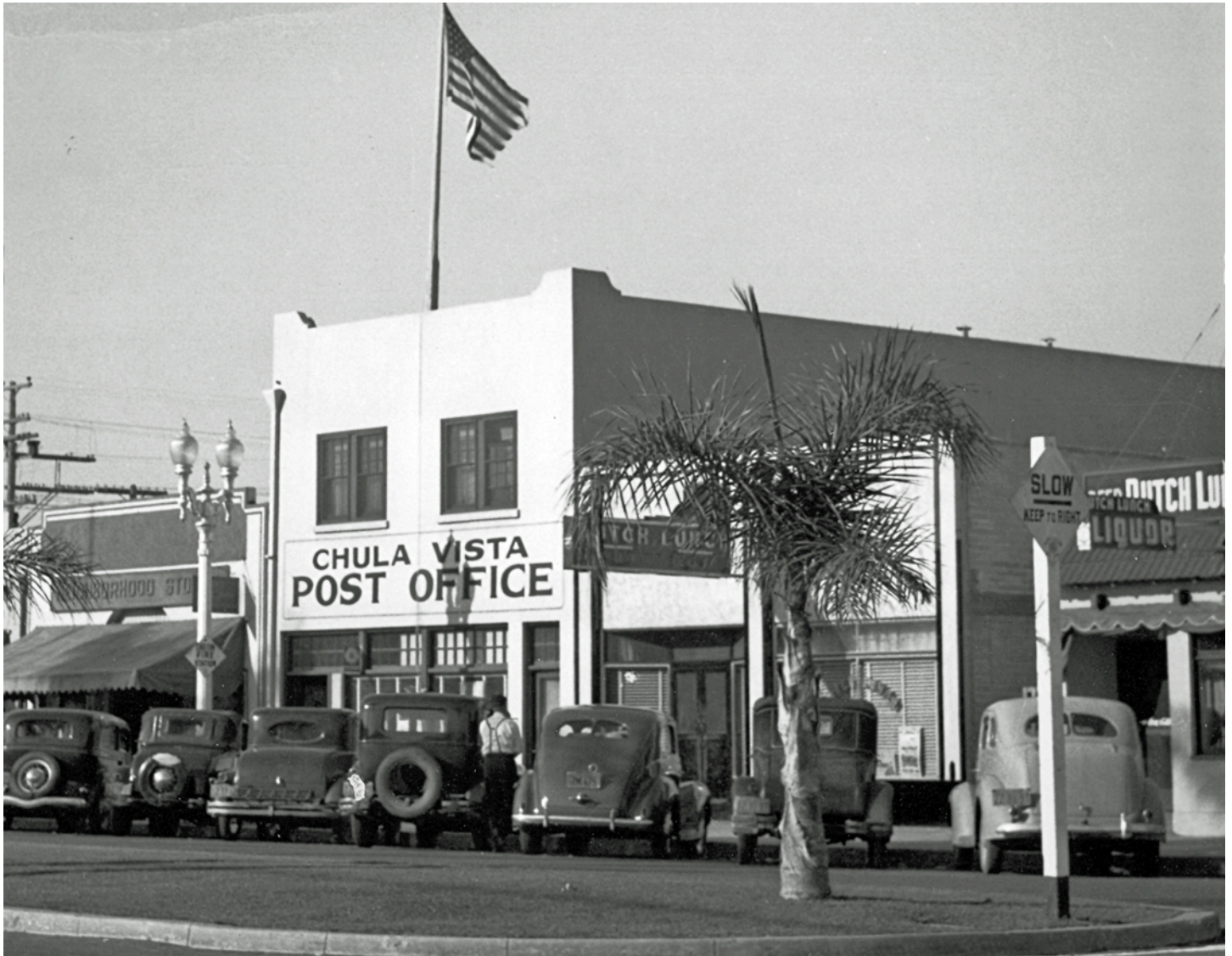
1937 downtown, Post Office at 315 3rd, Dock's Dutch Lunch at 317 3rd, Dutch Lunch Liquor Store at 319 3rd