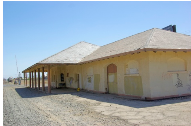
The San Diego and Arizona depot in El Centro was demolished in 2011.