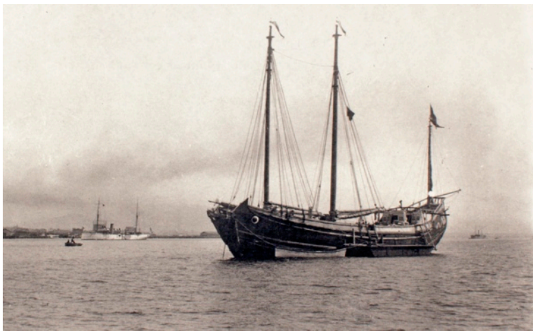
The famous Chinese junk Ning Po visited San Diego bay in 1913 and attracted attention because of its reputation as a pirate ship. It was built in 1753 at Foo Chow and for more than 150 years smuggled opium, carried slaves to Macao, pillaged villages on the Pei Ho and Yangtze rivers. When captured by the Chinese government, it was used as a prison ship. It was last used as a military vessel by the Manchu dynasty in 1910.

In 1873 the United States Army evicted Chinese fisherman operating from Ballast Point and they moved to La Playa where they established a shipbuilding industry. 1876 saw a state law regulating the size of Chinese net meshes reducing the size of the catches. In 1879 Congress voted to limit 15 Chinese per vessel coming from China. President Hayes vetoed the bill because it conflicted with agreements made with China. But the Angell Treaty of 1880 changed this agreement. Congress passed the Chinese Exclusion Act of 1882 which per the terms of the Angell Treaty suspended the immigration of Chinese laborers for a period of ten years. The Act also required every Chinese person going in and out of the country to carry a certificate identifying his or her status as a laborer, scholar, diplomat or merchant. By 1886 there were 12 Chinese fishing companies operating 18 junks. By the next year local fisherman Captain William Kehoe blamed Chinese fisherman for the decrease in the number of large fish in the Bay. In 1888 Congress passed the Scott Act which made re-