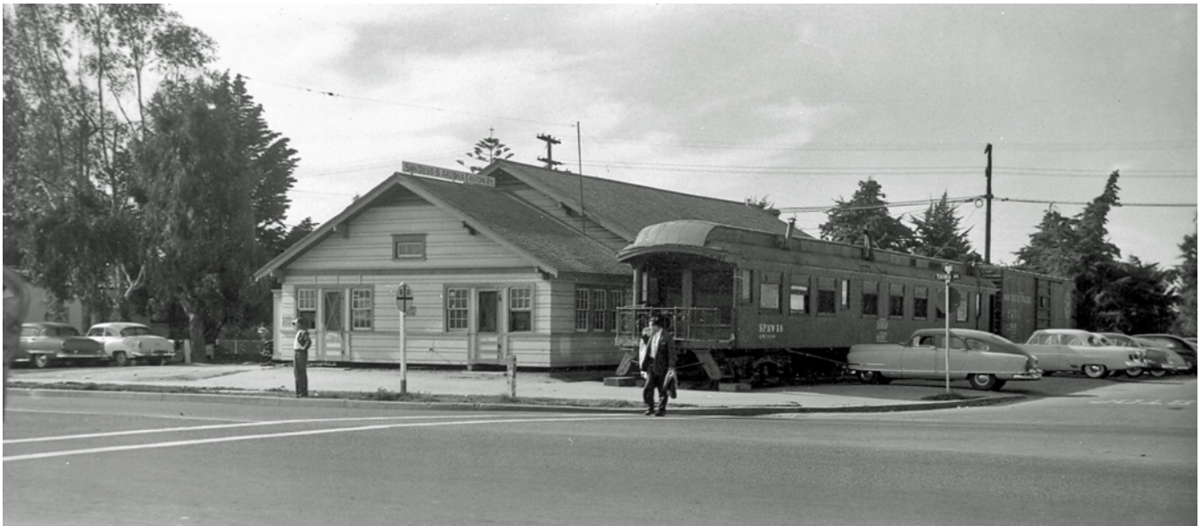
The Chula Vista depot for the San Diego and Arizona Eastern Railroad was built at 350 Third Avenue in 1919, now the site of Fuddrucker's. This new depot replaced the old NC&O depot that had stood in the center of Third Avenue since 1887.