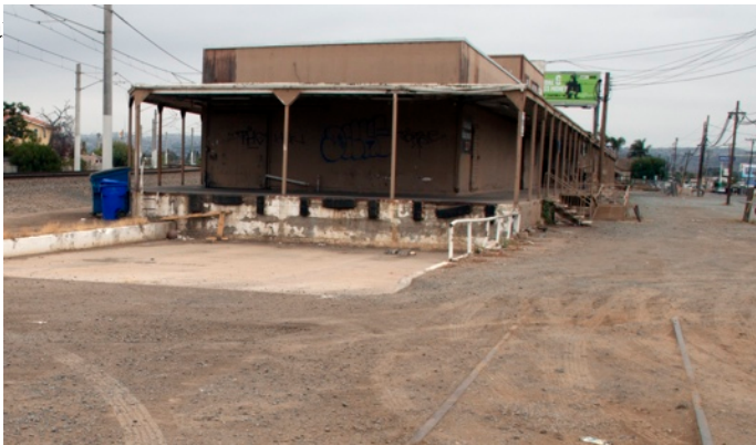
The NC&O tracks are still visible at the old Palm City depot along Hollister Street.