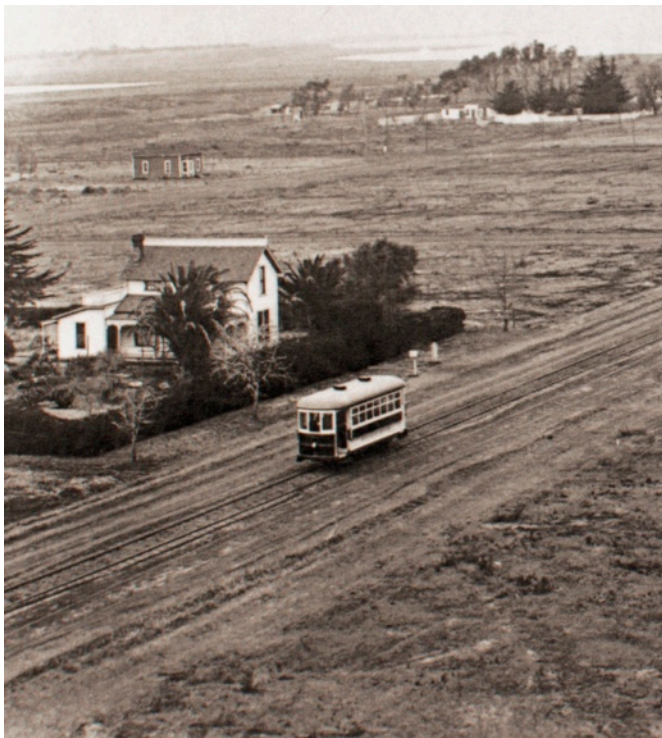
In Imperial Beach, Babcock's The Mexico and San Diego Railway took passengers from the boat landing at the end of 10th Street to the ocean beach and pier.

John D. Spreckels bought the NC&O in 1907 and electrified the line, creating a streetcar system known as the San Diego Southern Railway. The streetcars powered by overhead wires went from San Diego to Otay, but floods in the 1890s destroyed the tracks further south. The San Diego Southern Railway merged with the San Diego & Cuyamaca Railway in 1912 to form the San Diego & South Eastern Railway.