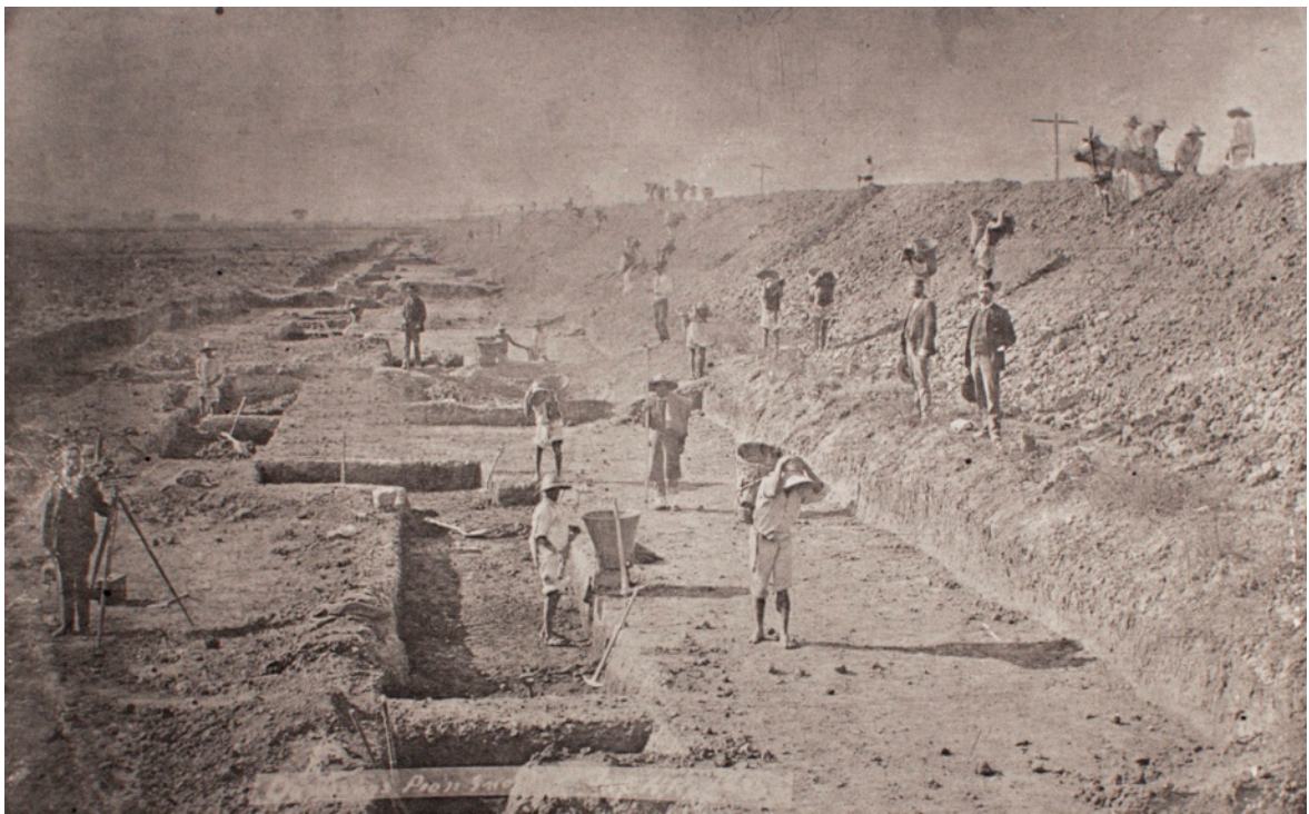
This photo from about 1881 shows Chinese working on the California Southern Railroad being built from National City north to Barstow.